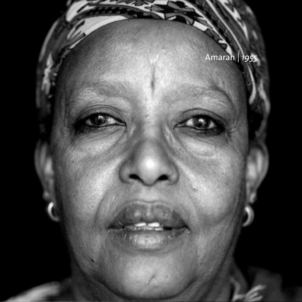
Amarah | 1955